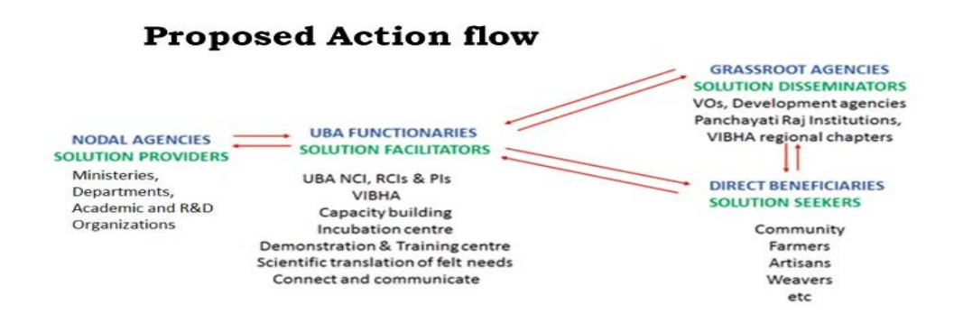
Figure 1: Proposed workflow of Solution Providers, Solution Facilitators, Solution Disseminators and Solution Seekers