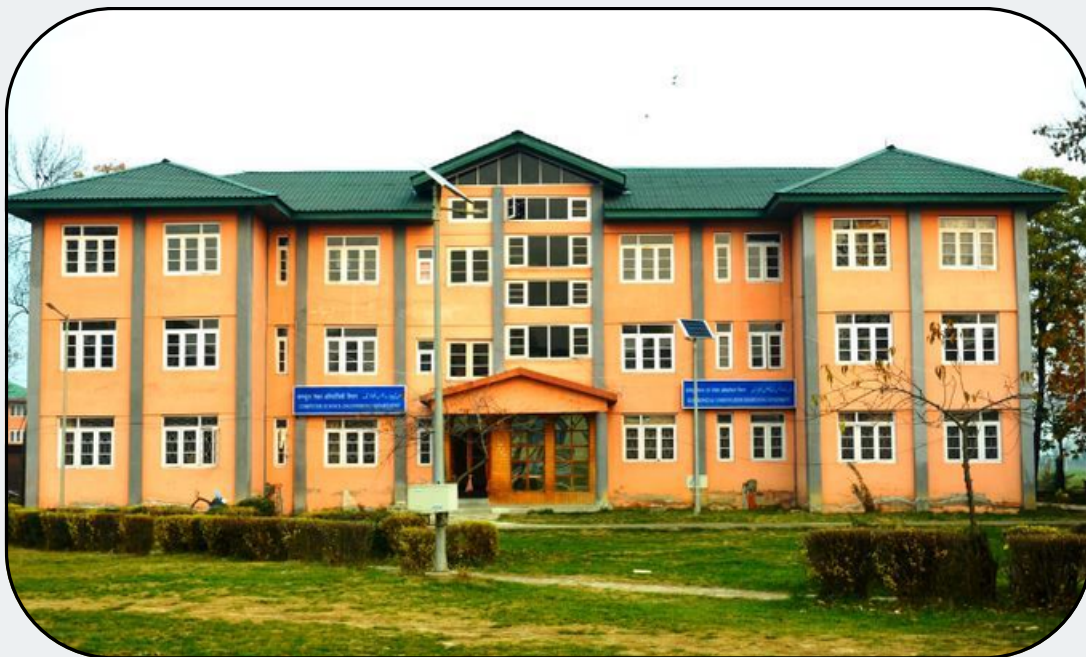
ECE Department Building