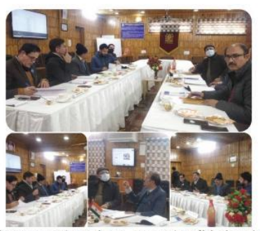
the campus, Directed NIT Srinagar also discussed manyotherthingsincluding

Apart from the creation of EWS infrastructure on